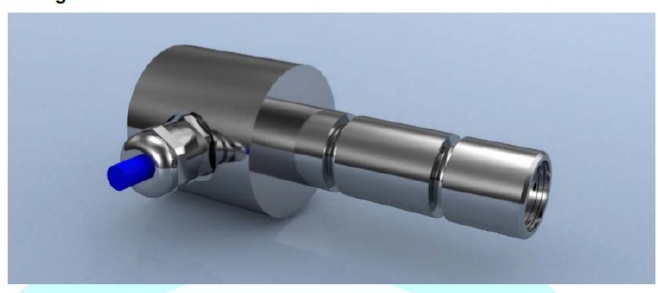
4256 Link Load Cell