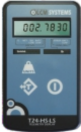
T24-HS-LS Simple wireless display for connecting to 1 load cell