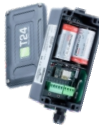
T24-AR Wireless range extender repeater module