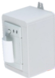
T24-PR1 Wireless surface mounting tally roll printer