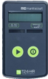
T24-HR Wireless display for connecting to multiple load cells