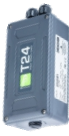
T24-SO Wireless serial ASCII output module