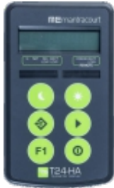
T24-HA Wireless display for connection to up to 12 load cells