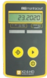
X24-HD ATEX Wireless display for connection to up to 24 load cells